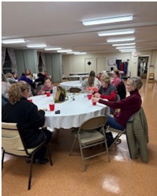
Messy Church December 2025